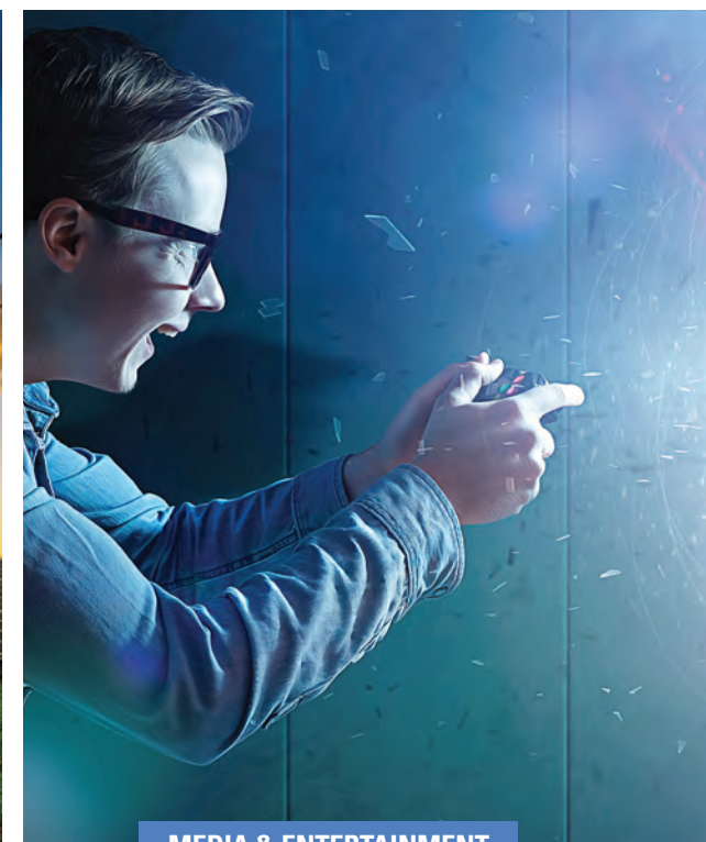
MEDIA & ENTERTAINMENT