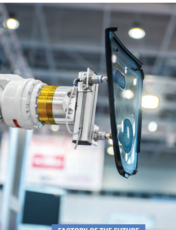
FACTORY OF THE FUTURE